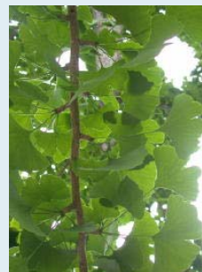
Gingko tree in the Wellesley College arboretum.