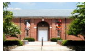
Ackland Art Museum

Photos will be posted on our blog ( http://wellesleync.blogspot.com ) and in the next newsletter when they become available.