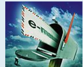
Switch to electronic newsletters