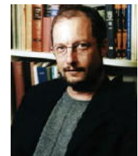
UNC Professor Bart D. Ehrman discusses the problem of suffering as portrayed in the Bible on May 30-31.

I would love to include events outside of the Triangle area. Please e-mail me suggestions at wellesleync@gmail.com .