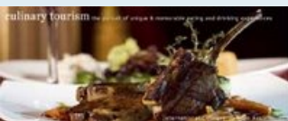
Restaurant Week in the Triangle on May 12-18.